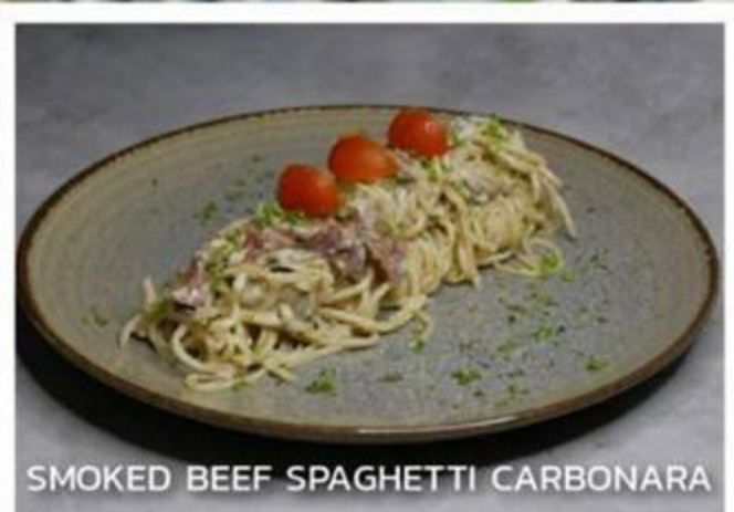
SMOKED BEEF SPAGHETTI CARBONARA