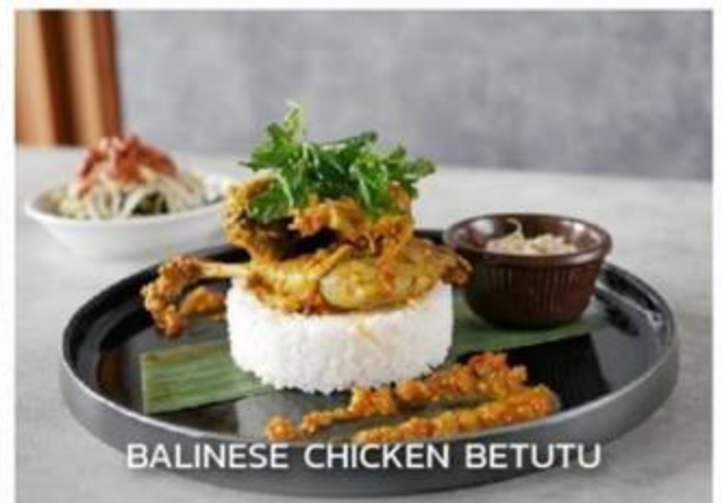
BALINESE CHICKEN BETUTU