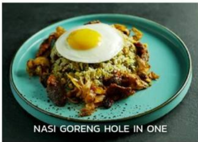
NASI GORENG HOLE IN ONE