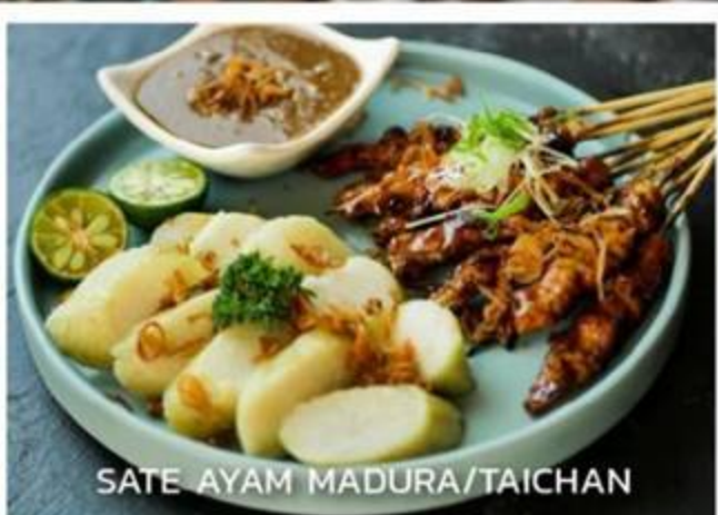
SATE AYAM MADURA/TAICHAN