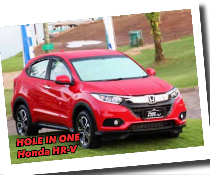
HOLE IN ONE Honda HR-V