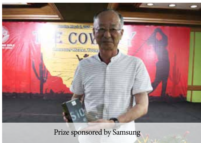
Prize sponsored by Samsung