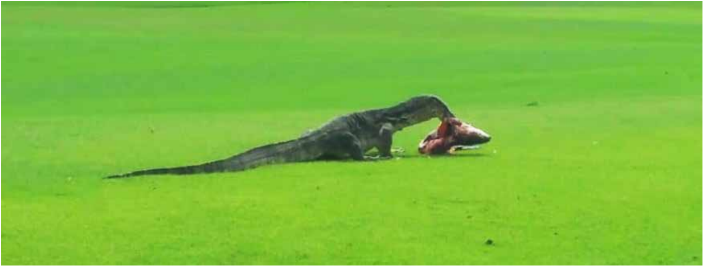
Berburu ikan di hole 18

Sebagai cabang olah raga yang berhubungan langsung dengan alam, olah raga golf sangat bergantung dengan kelestarian alam. Keseimbangan ekosistem dari flora dan fauna yang ada di dalamnya harus senantiasa dijaga dan dipertahankan. Untuk itu, Damai Indah Golf berkomitmen menjaga kelestarian satwa endemik, salah satunya biawak. Keberadaan biawak dapat juga menjadi sebuah atraksi alam saat bermain golf. Sehingga akan sangat menyenangkan bermain golf sambil melihat aktivitas satwa di sekitar.