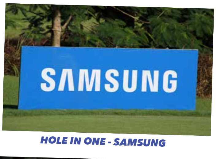
HOLE IN ONE - SAMSUNG