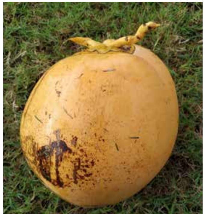
Kelapa Muda dan Kelapa Gading yang diambil langsung dari pohonnya

Penanaman kelapa di PIK Course juga memberikan manfaat secara visual. Selain mendukung konsep coastal landscape, bentuk batangnya yang tinggi dan tegak memberikan kesan ruang yang megah, sedangkan bentuk tajuknya yang unik memberikan kesan ruang pengarah pada penanaman di pinggir jalan.