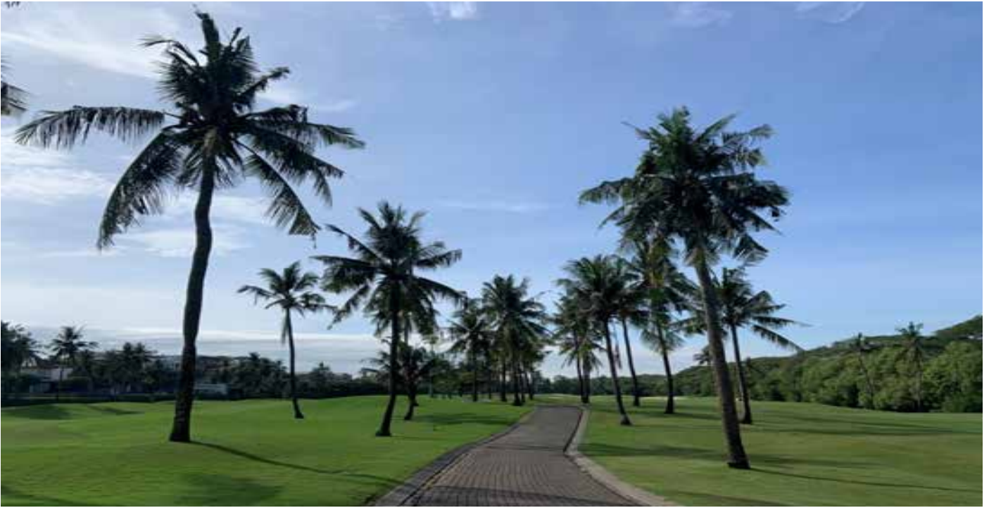
Penanaman Kelapa di pinggir jalan antara hole 6 dan hole 13 yang membentuk kesan ruang pengarah

Secara umum, tanaman kelapa sering dimanfaatkan untuk menunjang kehidupan manusia mulai dari akarnya hingga daun dan buahnya. Selain pemanfaatan untuk dikonsumsi, kelapa juga digunakan untuk bahan baku perabotan rumah tangga hingga obat-obatan. Dengan beragam jenis manfaatnya, kelapa sendiri sangat mudah untuk dibudidayakan. Proses penanaman dapat dilakukan dengan menyiapkan lubang tanam dan bibit kelapa unggulan. Lubang tanam disiapkan pada 2-4 minggu sebelum penanaman dengan tanah yang telah dicampur pupuk kandang atau pupuk lainnya sesuai dengan kebutuhan. Setelah lubang tanam siap, tanam bibit kelapa dengan kedalaman sekitar 10 cm dari permukaan tanah. Terakhir, lakukan perawatan dengan memberikan pupuk urea pada 1 bulan pertama dan selanjutnya pemupukan dalam satu tahun, yaitu saat musim hujan berakhir dan ketika awal musim hujan. Selain itu, penyiraman perlu dilakukan secara berkala, 2-3 kali dalam sehari terutama saat mulai memasuki musim kemarau.