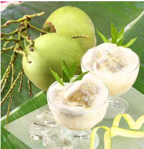
Es Sirsak Kelapa yang ada di PIK Course

Cocos nucifera atau yang memiliki nama lokal kelapa ini sering disebut dengan tree of life, karena setiap bagiannya memiliki manfaat. Pohon jenis palem ini toleran terhadap berbagai jenis tanah dan kondisi iklim sehingga mampu hidup di dataran rendah maupun dataran tinggi. Meskipun termasuk dalam tanaman yang mudah beradaptasi, kelapa akan tumbuh lebih optimal di dataran rendah atau pada ketinggian 0–450 m dpl, seperti kelapa yang tumbuh tersebar di PIK Course yang berada dekat dengan kawasan pesisir pantai. Kelapa yang tumbuh di PIK Course memiliki produktifitas buah yang tinggi dengan kualitas rasa yang jauh lebih manis. Buah kelapa yang dihasilkan dapat dicoba langsung di restaurant untuk menikmati segarnya air kelapa yang langsung diambil dari pohonnya.